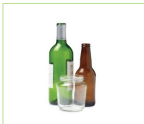
Glass Jars & Bottles