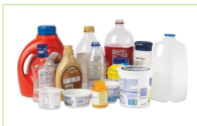
Rigid Plastic Containers Codes (1, 2, 3, 4, 5, 7)