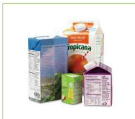
Juice Boxes & Milk Cartons

Rinse all containers thoroughly to keep recycling working!